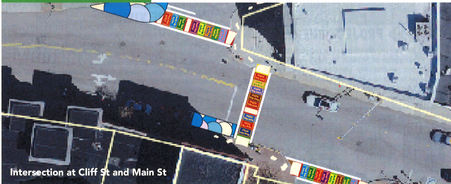
Intersection at Cliff St and Main St

Boosts local businesses as residents and tourists frequent downtown to enjoy the shops, restaurants, and amenities.